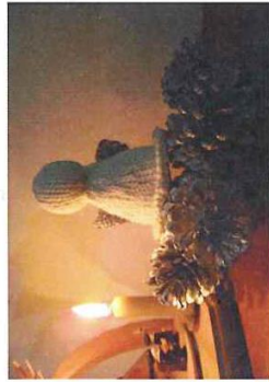
This angel is knitted in sparkly cream, with sparkly mohair wings.

Repeat these 6 rows, 4-5 times as necessary. Sew wings to the body.