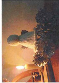
This angel is knitted in sparkly cream, with sparkly mohair wings.

Repeat these 6 rows, 4-5 times as necessary. Sew wings to the body.